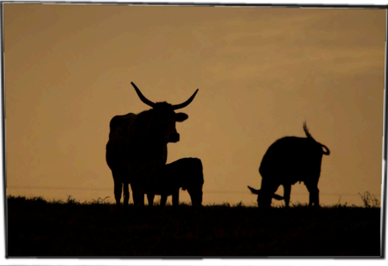
Kings Grant is a B'nB miles from anywhere that most of us know.. Therein lies its beauty, plus excellent cuisine. And these cows across the road.

The feel is vintage luxury, with a five-star hotel group managing the experience, or what the industry likes to call product . The cuisine is top-notch and the linen likewise, with a gloriously expansive king-size bed occupying most of the cabin and the bathroom boasting all the right fittings.