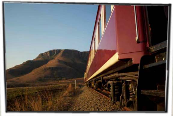
The southern Drakensberg is far off the beaten track. Natural beauty, excellent birding and a winning steam-train experience is what it offers.

It's the story of an Austrian Trappist monk who in the late 19 th century set himself the task of creating a self-sustaining world of beauty and education.